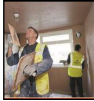
Plastering / Patch